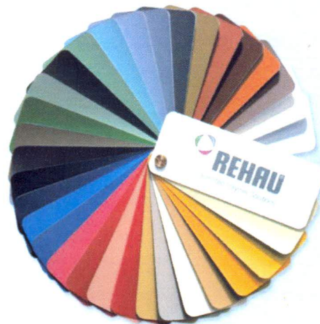
REHAU ACRYL II COLOUR CHART